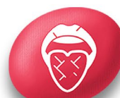
Cracked lips/'strawberry' tongue