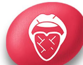
Cracked lips/'strawberry' tongue