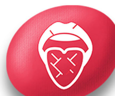
Cracked lips/'strawberry' tongue