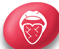
Cracked lips/'strawberry' tongue