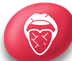
Cracked lips/'strawberry' tongue