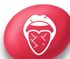
Cracked lips/'strawberry' tongue