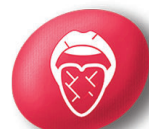
Cracked lips / 'strawberry' tongue