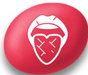
Cracked lips/'strawberry' tongue